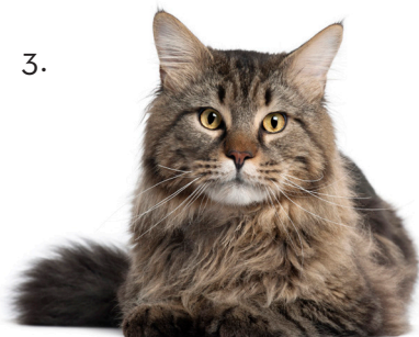
Maine coon cat