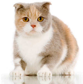
Scottish fold cat